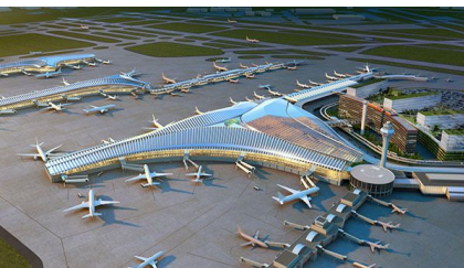
O'Hare International Airport

BONDING Bonded with Travelers Casualty and (rated A++ Superior)