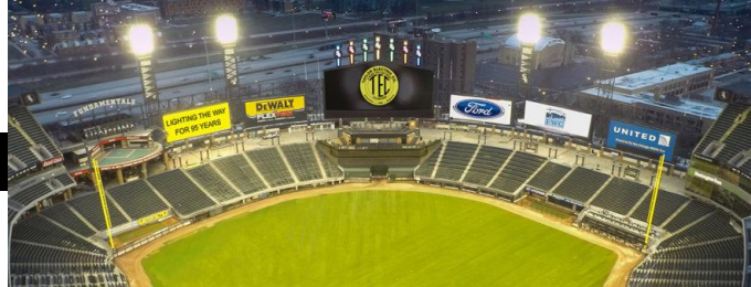
Guaranteed Rate Field